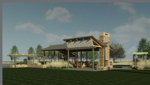
Proposed R Park Pavilion

and includes $50,000 fundraised by the Citizen's Initiative for R Park.