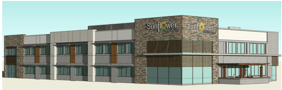
Rendering of new medical office building from Roe Boulevard Perspective

building will be situated in the southwest corner of the site closest to Roe and Johnson Drive with surface parking in the back. The City plans to close on the sale in December with construction to begin late winter/early spring 2020.