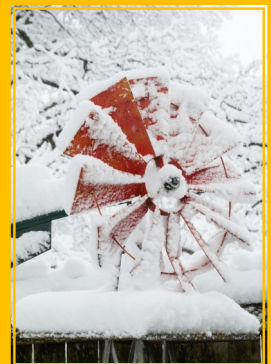
3rd Place - Heather Brantman

If you missed the first photo contest, stay tuned to the City's website for the next contest in 2020.