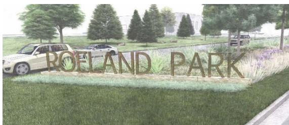
Proposed gateway feature for Roe Blvd Redesign Project

Stay tuned to the City website and social media for regular project updates throughout 2020.