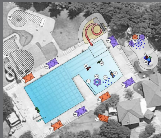
Layout of possible improvements provided by Water's Edge

2020 will be a big year for Roeland Park. In addition to Roe Boulevard improvements, the City also intends to begin major improvements to the Aquatic Center (RPAC) and R Park. RPAC improvements total $1.64 million and plans include in-pool float features, additional lighting, new tube slide, shade structures, new toddler slide, ADA features, spray ground and demolition of some older features. Construction is anticipated to begin after the 2020 summer season and be complete prior to the 2021 summer season.