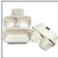
Paper Egg Cartons