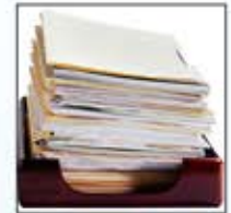
File Folders Office Papers