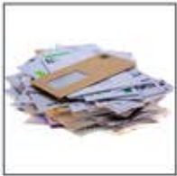
Open Mail Greeting Cards

YOU CAN NOW PLACE ALL RECYCLABLES IN ONE BIN!