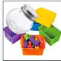
Plastic Tubs Screw-top Jars