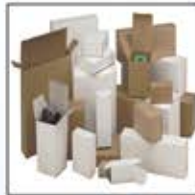
Paper Board Boxes