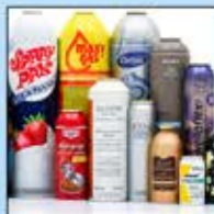
Empty Aerosol Cans (no caps)

Please flatten all cardboard boxes. Empty and rinse all containers.