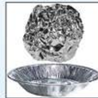
Balled Aluminum Foil (2" or larger) and Pie Pans