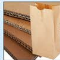
Corrugated Cardboard Paper Bags