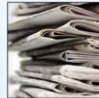
Newspapers & inserts