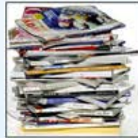
Magazines, Brochures & Catalogs