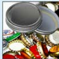
Loose Metal Jar Lids Steel Bottle Caps