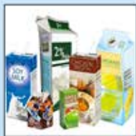
Paper Milk Juice Cartons