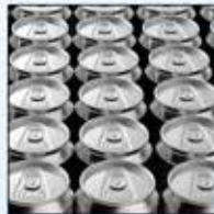
Cans (do not crush or flatten)