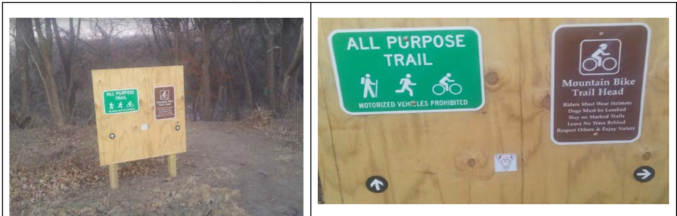
Table 1: Current trail signage at Nall Park

Jon Dunn is a Roeland Park citizen, a member of the Nall Park multiuse trail facebook page, an avid biker, and the co-founder of 2AMarketing ( http://2amarketing.com/ ), a local marketing firm. He is designing and working up a proposal for trailhead information signage that would include: trail logo (Table 2); trail rules; yield graphics; trail map with legend; possibly website/facebook urls for checking trail closings and updates. Parks is discussing display mediums for the signage.